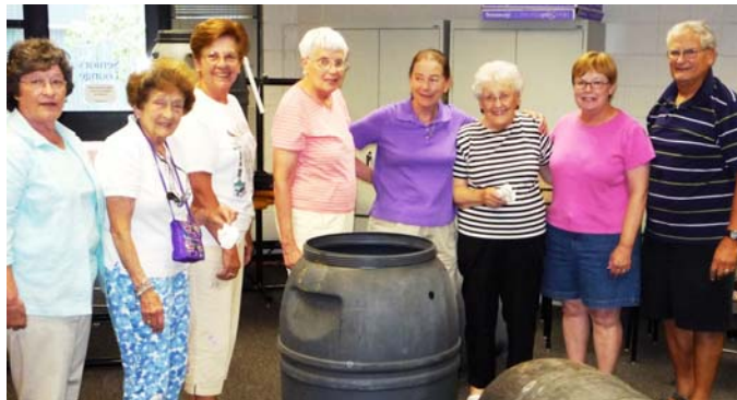
Seniors Make Rain Barrels at Senior Center.