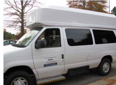
New 13 passenger wheel chair accessible van.

Call the Senior Center at 757-259-4187 for more information.